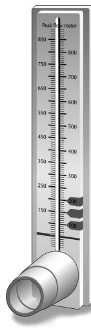
Fig. 2. Typical peak flow meter. Illustration: John Yanson.

Patient self-monitoring of PEF r provides valuable insight to the course of asthma throughout the day, assesses circadian variation in pulmonary function, and helps detect early signs of deterioration so that timely therapy can be instituted. Patients with persistent asthma should be evaluated at least monthly and those with moderate to severe asthma should have daily PEF r monitoring. 37 The typical PEF r in pregnancy should be 380–550 L/min. She should establish her “personal best” PEF r , then calculate her individualized PEF r zones: Green Zone more than 80% of personal best, Yellow Zone 50 to 80% of personal best, and Red Zone less than 50% of personal best PEF r .